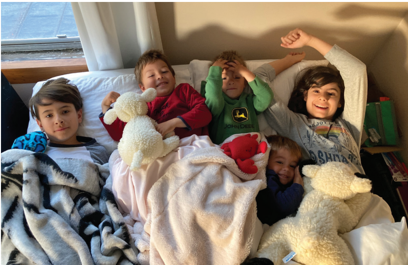
Morning blessings! Can you find 5 children in this picture?