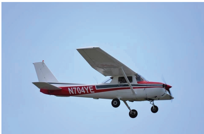
This Cessna 150 is my faithful adventure companion

That’s the God our family is excited to share with the people of Baramita, Guyana, and everywhere! The One who is walking us through this world, holding