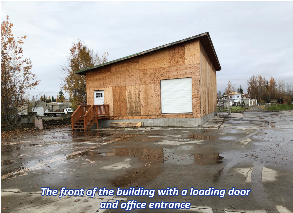
The front of the building with a loading door and office entrance