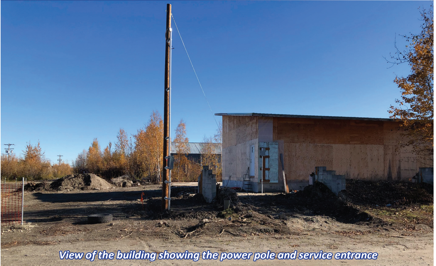
View of the building showing the power pole and service entrance