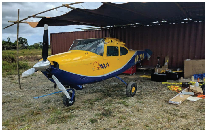
Pathfinder Plane Ready for Wings

Pray that the AWA project will be a light in a dark place, and that we will bless others with the gifts we've been given in the way of the tool called aviation and also the truths for these times.