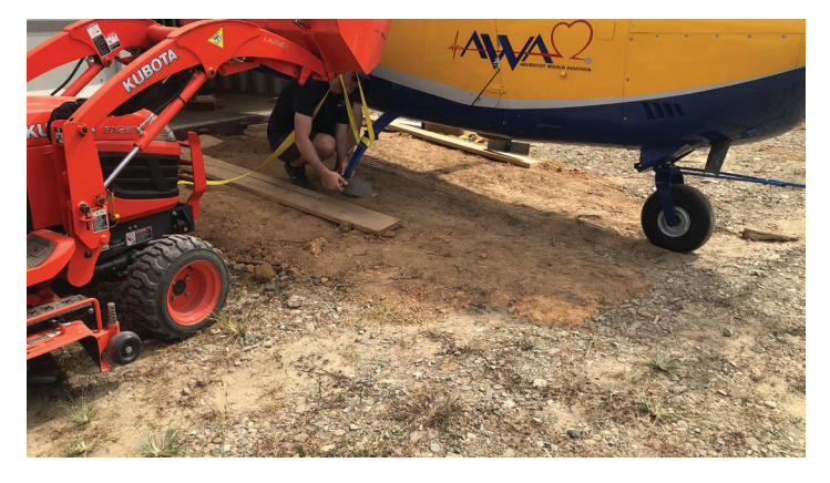
Tire Being Changed for Removing Aircraft