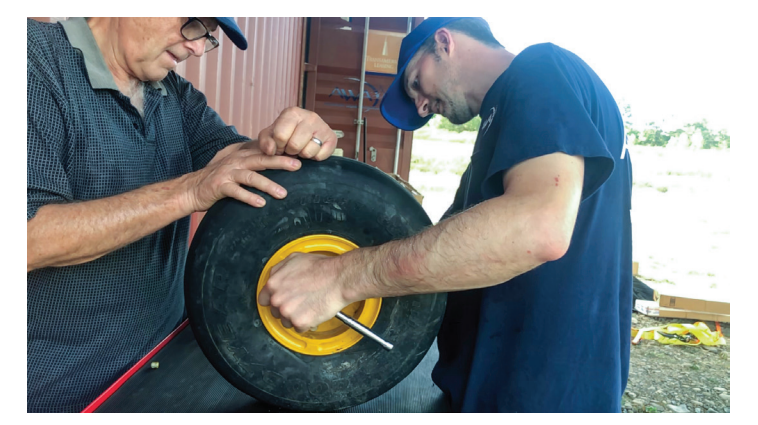
Guys Tire Work