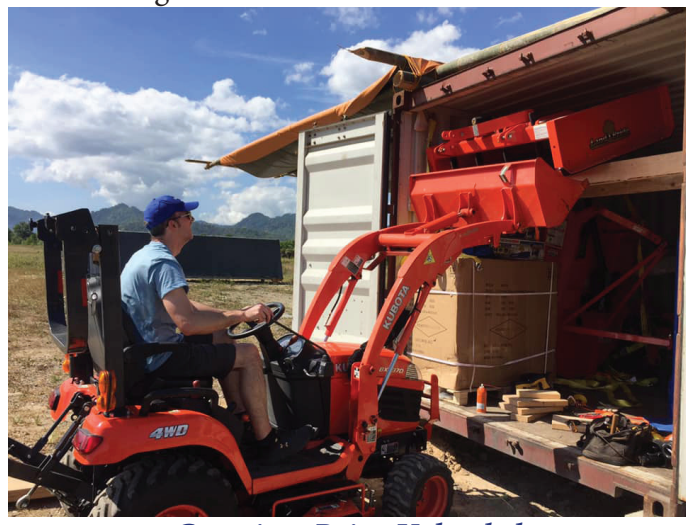
Container Being Unloaded

Please keep this project in your prayers as we're not out of the woods yet, and truly we won't be until we see Christ coming in the clouds.