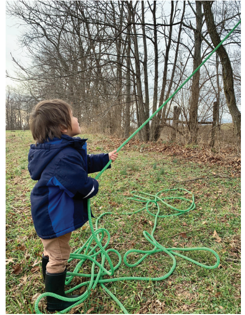
Future Tree Man

So! In the face of a world being turned upside down and people going crazy - maybe even you included,