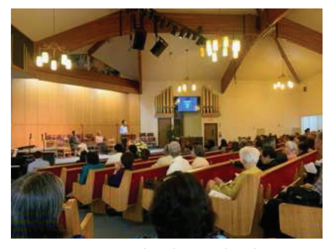
Loma Linda Filipino Church