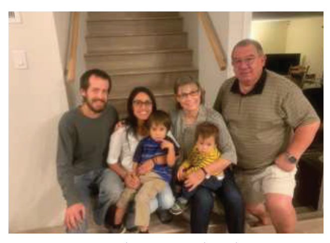
Family We Stayed With