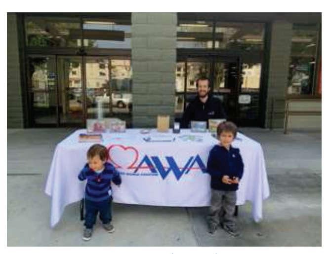
Loma Linda Market

The churches were thrilled with the thought of us going to the country of their origin and supported us wholeheartedly. We also met people in California who had a heart to serve as volunteers. Keep them in prayer as they seek to give their talents to the Lord and His work.