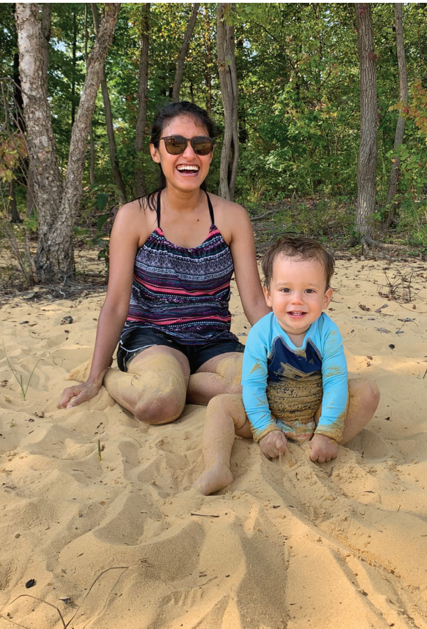
Lake day with friends