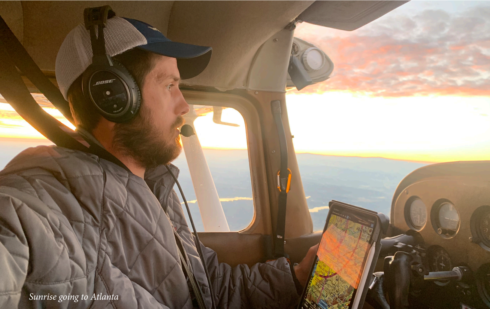
Sunrise going to Atlanta