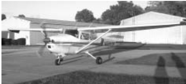
Left: The N58636 with all the modifications. Below: Andy Checking seats and controls.

We found a few details that had to be remedied before we head west to the Oakland California area and a shipping container. Radio troubles (seems we had a blown diode in Nav/Com 2) effectively shut down our Instrument Flight capabilities. Thank-