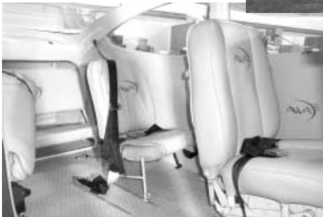
Labor of love: interior specially upholstered seats by Pam Rossi.