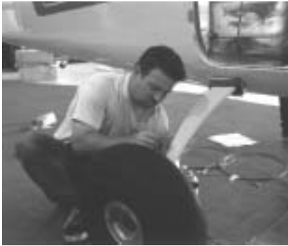
A volunteer from Basler Turbo Conversions, Oshkosh, WI, works on landing gear. AWA is grateful to the many volunteers who worked late nights on the mission aircraft.