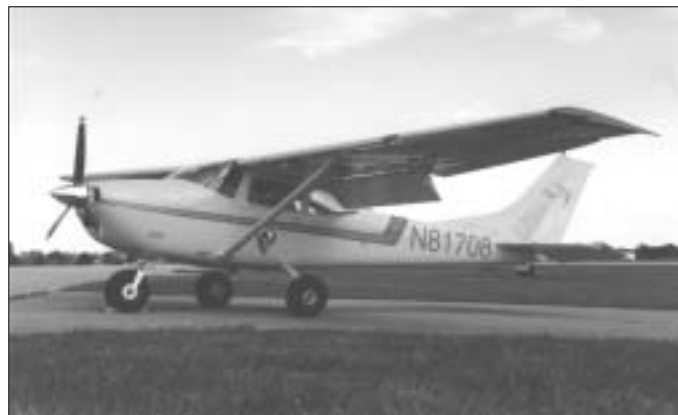
Project AirPower aircraft in readiness for the historic dedication service at Oshkosh, Wisconsin.