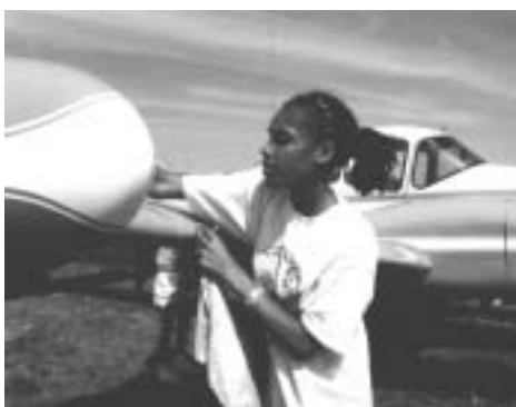
Pathfinders from all over the world get their hands on AWA mission planes.