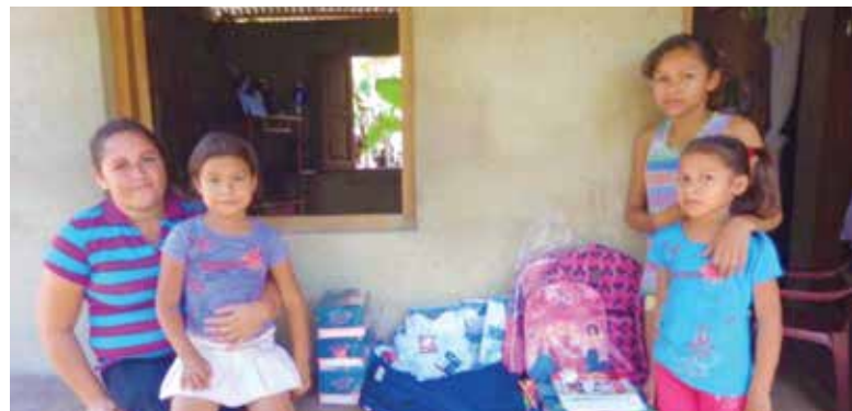
Top: Working on the well that brought fresh water. Above: Several village children who are befriended by AWA team members.