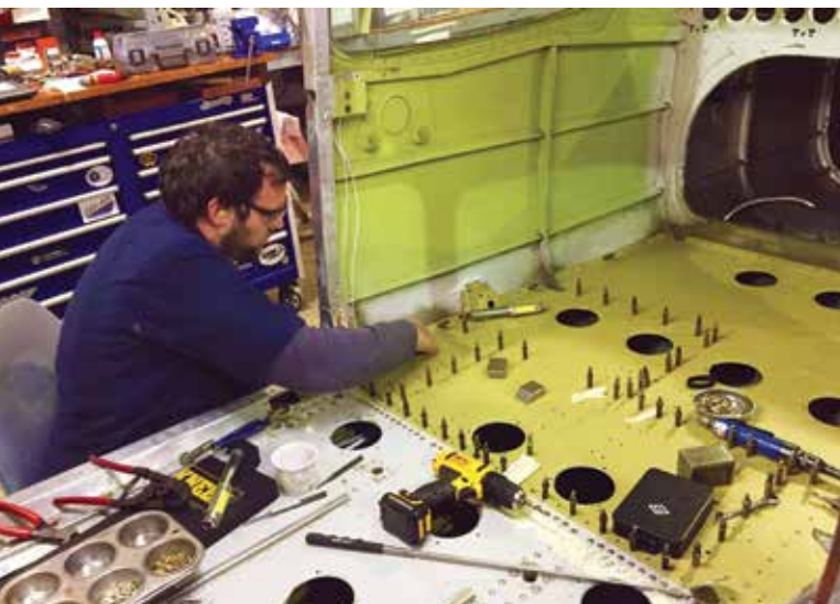
Work being done on the inside.

Watching the Pathfinder I airplane take off from the Mabaruma airstrip for the last time, I never in my wildest dreams thought that it would be sent to the Philippines, AND, NEVER once did I think that I'd be