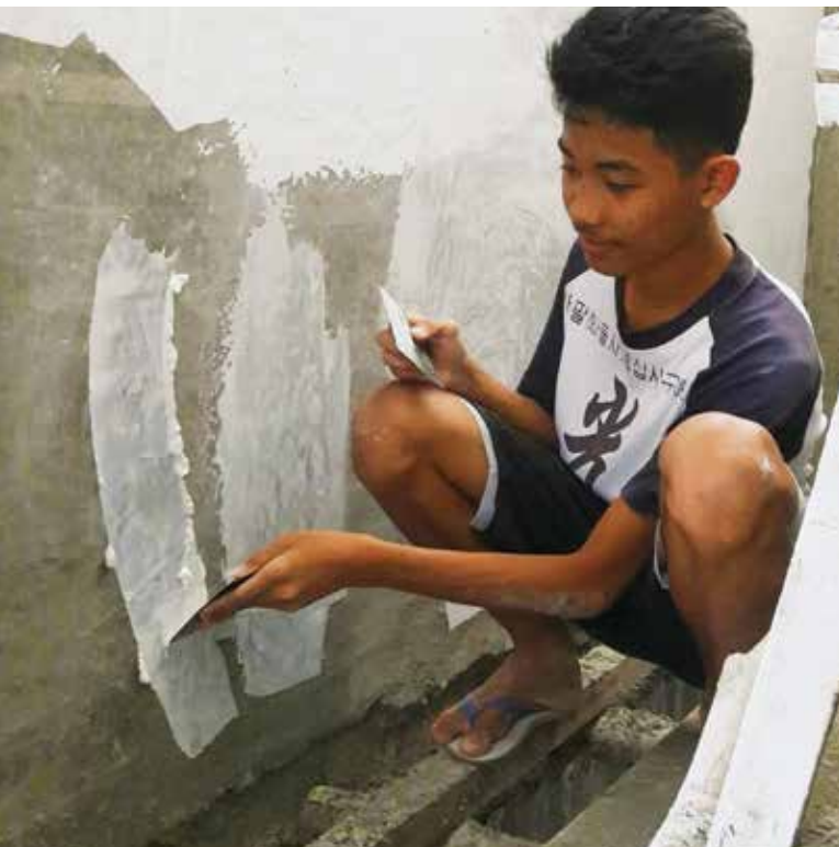
One of the workers painting the walls of the mission house.