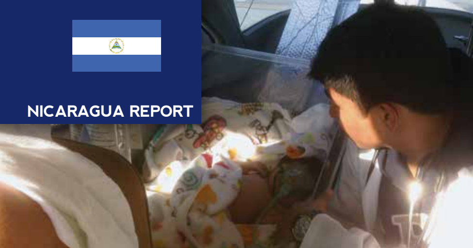
The doctor checking the baby's breathing.