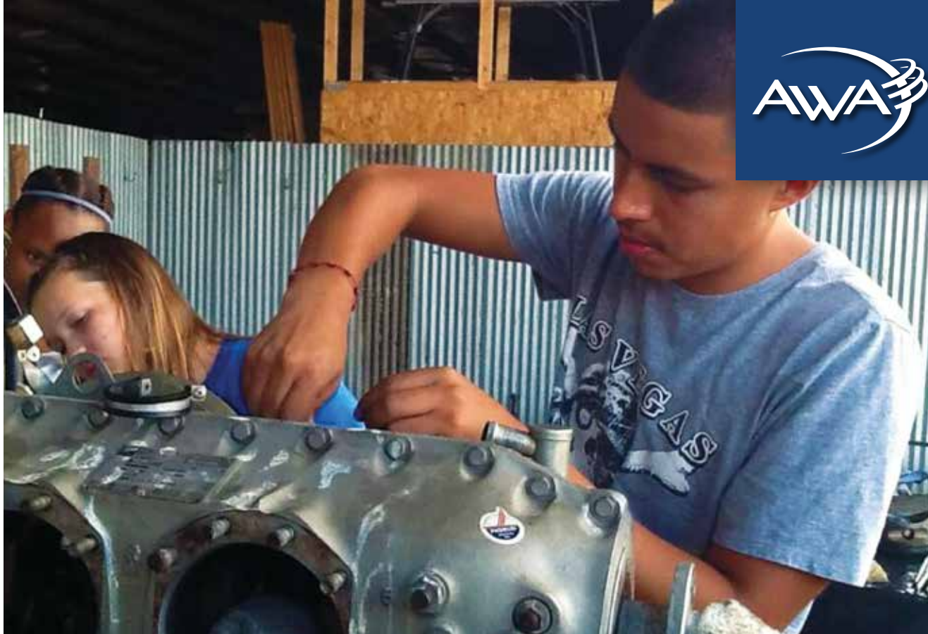
Students of the STEM project working on aircraft.