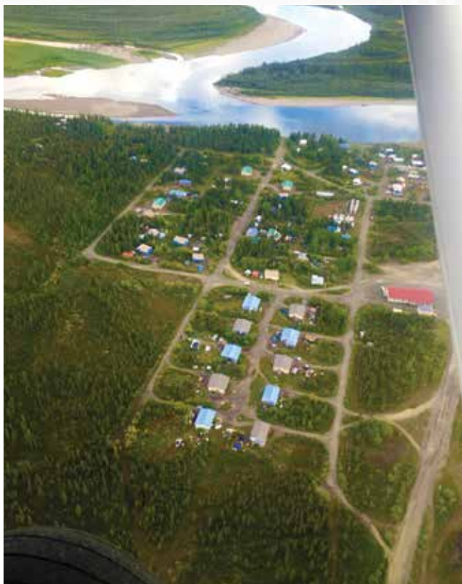
Aerial view of Ambler Village.