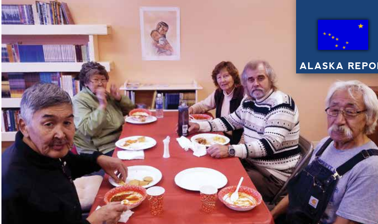
Selawik Church Fellowship.

installation of several radio stations across the northern region. The establishment of more stations is being planned. The installation of a radio station in Shungnak Village was completed in October 2016. All the stations have pre-programmed content from Seventh-day Adventist sources, with local programming capabilities. Many villagers are tuning into the radio stations and hearing the message of Jesus.