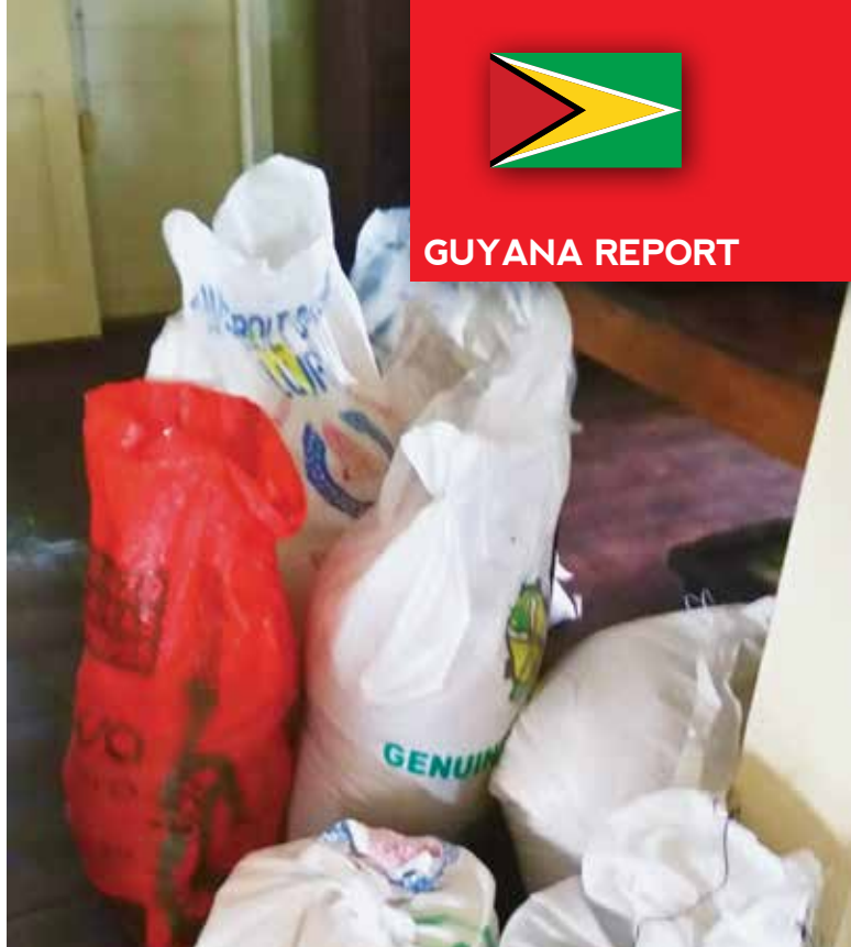
Flour, rice and sugar that multiplied.

mission service to see what God will reveal.